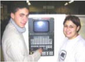
2- Computer-aided Mechanical engineering.

The attraction for studies in a natural habitat is worth the attraction for studies in town