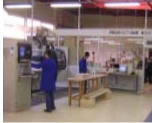
1- Computer-aided wood processing. (BAC PRO)